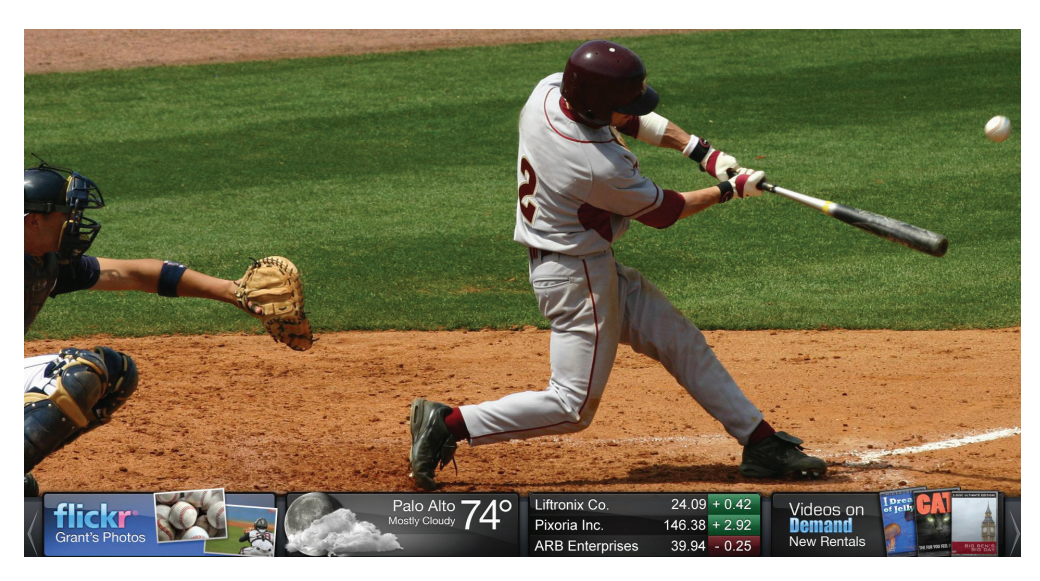
Figure 2. The user interface is designed for TV-centric viewing and easy control and navigation using the TV's remote. Widget Channel complements, rather than distracts from, traditional TV viewing, thereby avoiding the usage model issues that have plagued Internet-based interactive TV services in the past.

Widget Channel is an essential building block that provides a set of key capabilities: