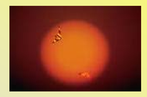
What is fusion?