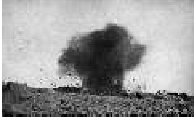
German artillery shell exploding near British lines.