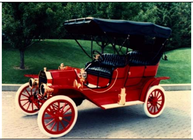
This is the new Model T Ford. Come and see it is a great buy Only $650

Up to 45 mile per hour A Pure LUXURY car