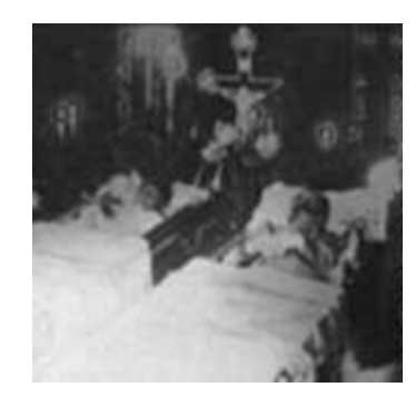
The Archduke and Duchess lie dead in Sarajevo.

The country of Italy betrayed the other two countries and joined the triple entente to fight. The war ended when on November 3, when Italy, France, and Great Britain smashed Austria-Hungary and caused Austria to sign an armistice.