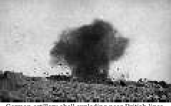
German artillery shell exploding near British lines.