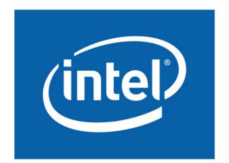
White on Intel Blue