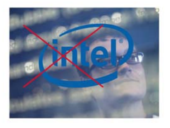
Do not put logo on complicated photos