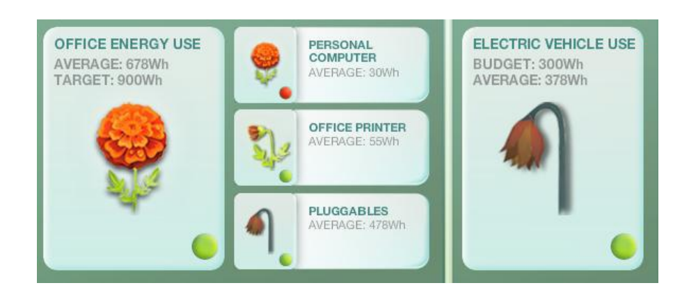
Personal Office Energy Manager - POEM