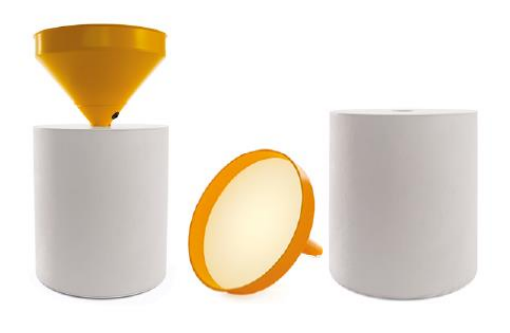
TABLE / TORCH

Description : the two components of this table can be separated. The cylinder base supports a cone that just happens to be an LED torch.