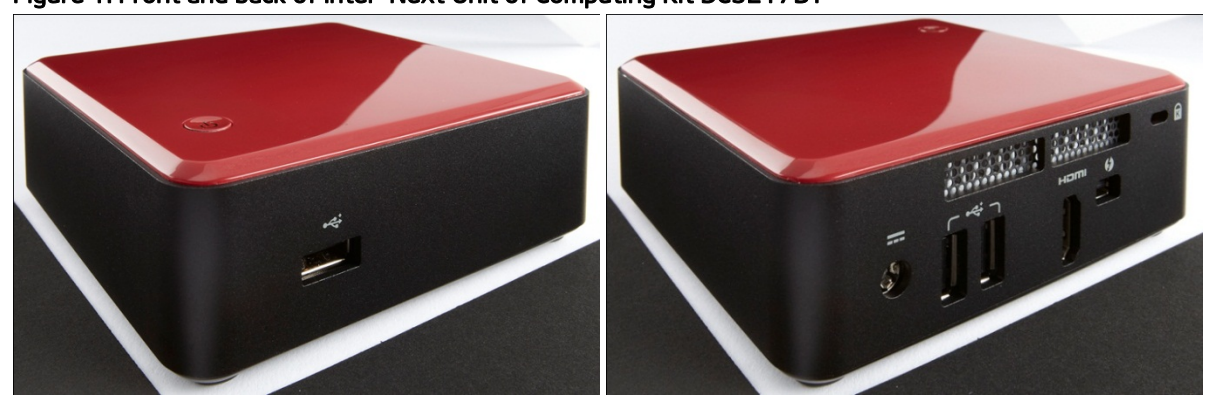
Figure 1: Front and back of Intel® Next Unit of Computing Kit DC3217BY

The NUC is the epitome of versatility and portability.