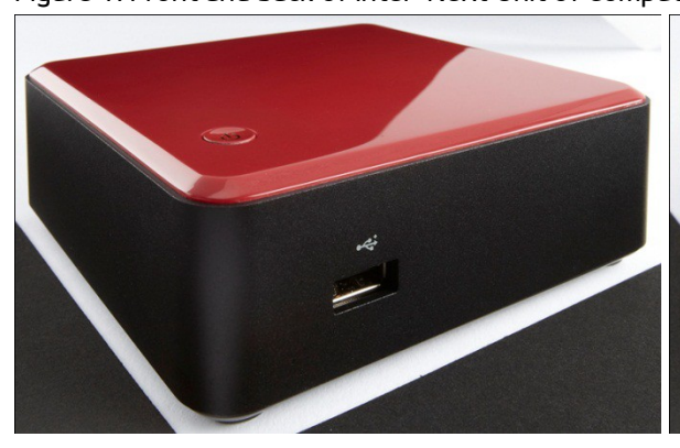
Figure 1: Front and back of Intel® Next Unit of Computing Kit DC3217BY

The NUC is the epitome of versatility and portability.