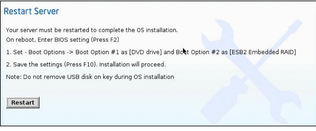
Figure 37: Screen Indication to Install Windows 2008 Server*

During server POST, press < F2 > key to enter server BIOS configuration interface. If your server has more than one hard disk device, edit the [ Hard Disk Order ] in BIOS menu [ Boot Options ] to move the disk that are installed Windows 2008 Server* by IDA as the first Hard Disk #1 . Return back to BIOS [ Boot Option ] page, set Boot Option #1 to the DVD-ROM that has Windows 2008 Server* DVD, set disk that are installed Windows 2008 Server* as Boot Option #2 . Press < F10 > to save BIOS setting and leave.