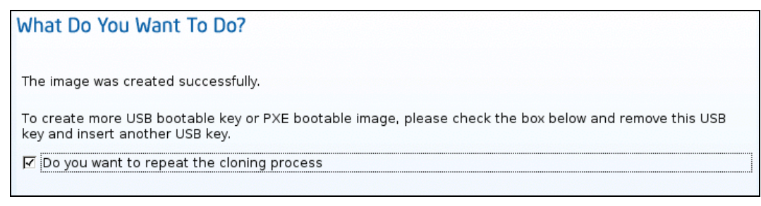
Figure 45: Option of repeat the cloning process

IDA allow user select an option of repeat the cloning process to create more bootable USB key or PXE bootable image.