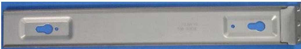
Figure 2: Correct Fixed Mount Bracket

The correct brackets should have “Key Hole” slots to match the mounting studs of the 1U and 2U chassis. The following picture shows the correct bracket to use with the Intel Server Chassis SR1400 or SR2400.