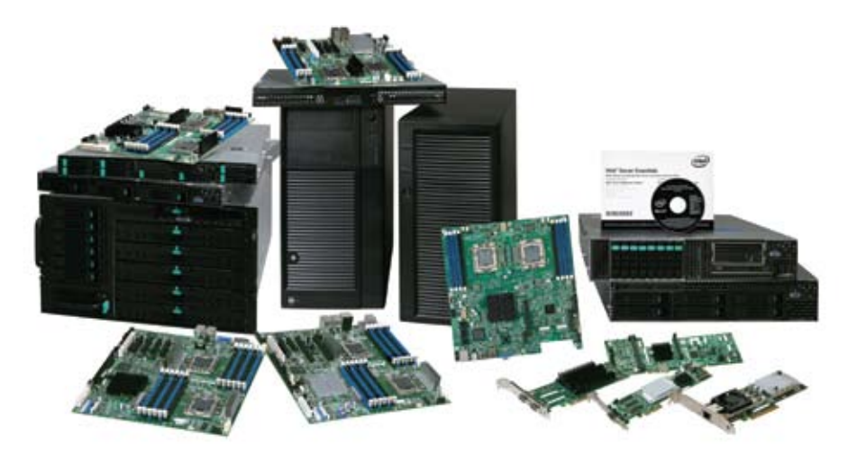
Intel® Server Products: Quality You Can Trust

For more information on PCNs and 10-month EOL notices, visit: http://intel.pcnalert.com/