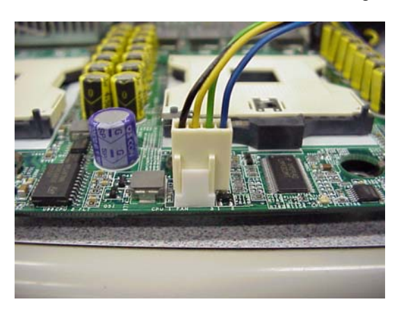
Figure 2: 4-pin fan connector plugged into 3-pin fan header for Processor 1

The Intel® Server® Boards SE7320SP2 and SE7525GP2 support both the active and passive processor SKUs. The active processor heatsink uses 3-pin fan headers on the server board. In addition to continuing to support the 3-pin fan connector, the OEM 10-pack server boards accommodate the new 4-pin connector. For processor 1, this connector is installed onto the 3-pin CPU1 fan header on the server board, with the PWM signal left unconnected. See Figure 2.