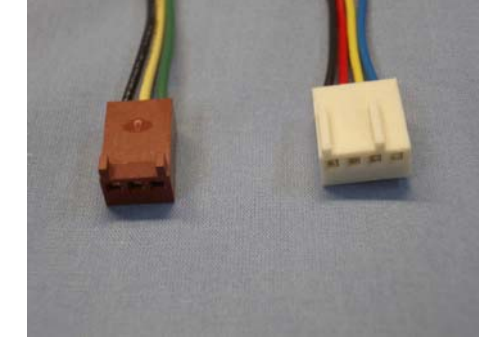
Figure 1. 3-pin and 4-pin heatsink fan connectors

The 64-bit Intel® Xeon® processor with an 800-MHz system bus and 2 MB of L2 cache is shipping with a new heatsink fan that has a 4-pin connector (see figure 1 below). Processor heatsink fans are included only on the active boxed processor SKUs, passive boxed processor SKUs will continue to ship a heatsink with no fan. When integrating the Intel® Server® Board SE7320SP2 or SE7525GP2 into the Intel® Server Chassis SC5300, the passive version (no fan) of the Intel® Xeon® processor must be used. For integration into the Intel® Entry Server Chassis SC5275-E or instances where the server board is integrated into third-party chassis, the active heatsink solution may be required to meet the processor cooling requirements.