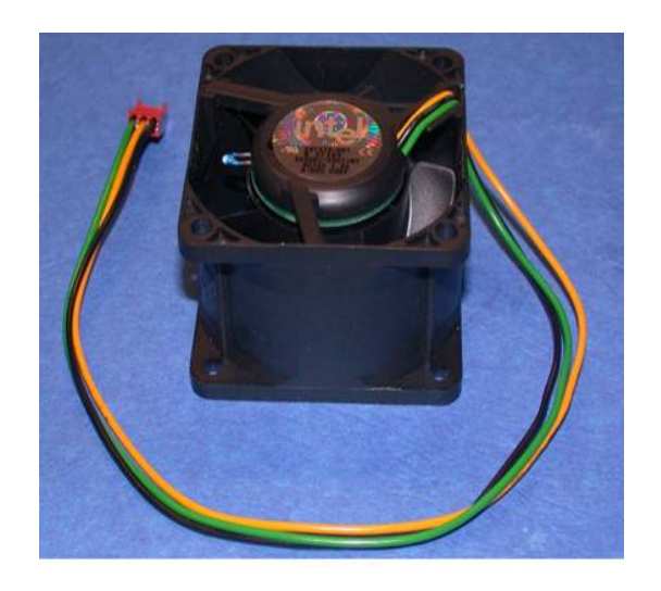
Figure 1. 38mm Fan w/1.5A requirement

Boxed Intel Xeon® Processors at and above 3GHz use larger fans, i.e., 38mm, than the 25mm fans used in 2.8GHz and below solutions. These fans being much bigger require more current draw, i.e., 1.5A versus the 340mA required for the 25mm fan. Older SE7501HG2 baseboards (eg., PBA A95718-303) cannot support this "extra" current requirement. An easy workaround is to draw this required extra current directly from the power supply. A fan cable adapter with tachometer sense (Part #:FW04B58-DN, Supplier Foxconn, Katie.Wang@foxconn.com) solution has been proposed that accomplishes this in a rather simple fashion.