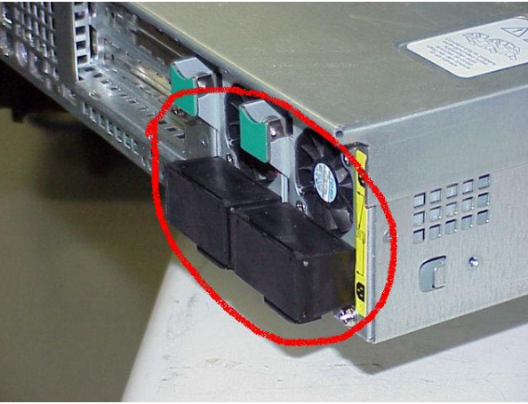
Fig. 1 DC power supply chassis (right) Vs. AC power supply chassis (left)

When using the Intel® Server Chassis SR2300 shipping material, customers must modify the packaging for the Intel® Server Chassis SR2300 in order to accommodate the DC power supply Cage and Module. Refer to the pictures below for the before and after modification.