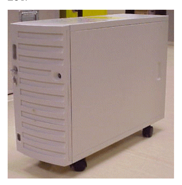
Figure 2-1 Enlight, EN8950 File Server Tower Chassis