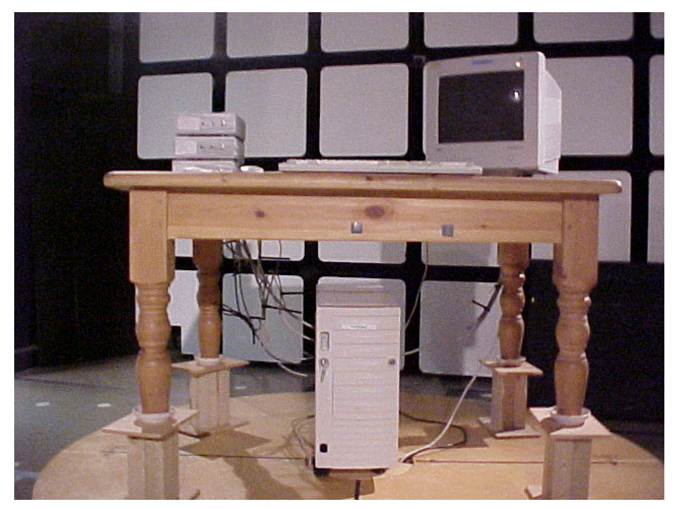
Figure 4-1 Generic test set-up

See section 2.3 for details of support equipment.