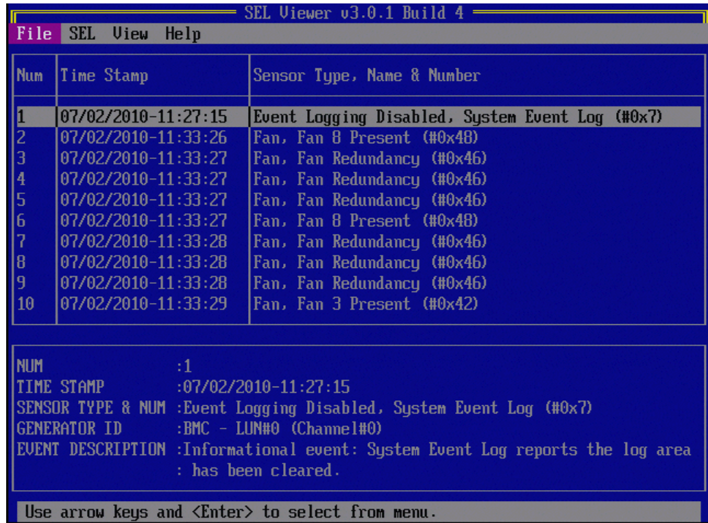
Figure 1: SEL Viewer Text View