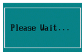
Figure 5: Status Box

When the utility is first invoked, it loads the SEL records from non-volatile storage on the server. A status box as shown in Figure 5 is displayed to indicate that the SEL Viewer is loading SEL records from the server. In Linux*, the status message is displayed on the status bar of the Utility main window.