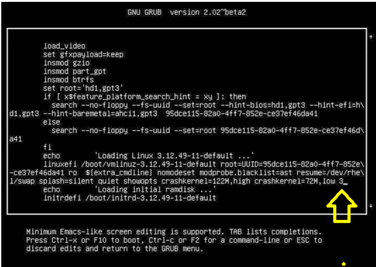
Figure 5. Edit kernel module parameters