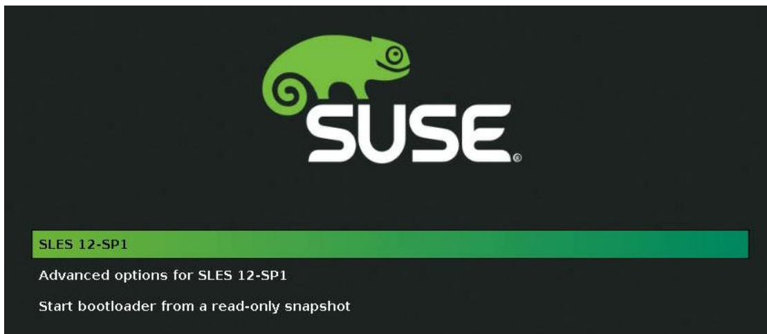
Figure 4. Press <E> to edit selected GRUB menu option