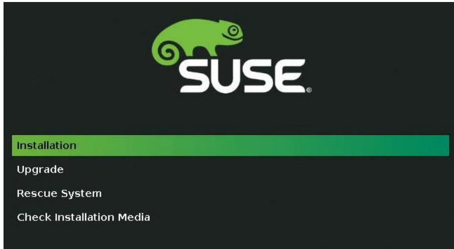
Figure 1. Press <E> to edit the Installation boot menu