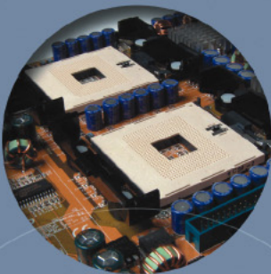
603-pin socket for Intel® Xeon™ processor